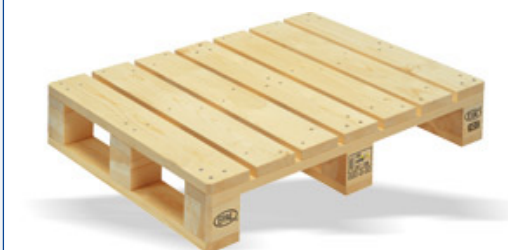
EUR6 Euro pallet