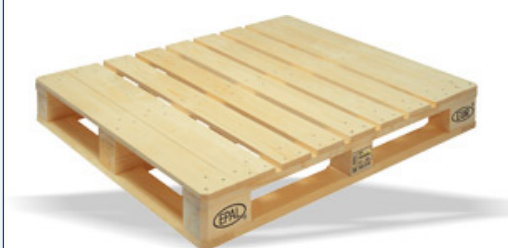
EUR2 Euro pallet

All bearing loads are based on evenly distributed loads.