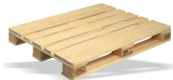
EUR3 Euro pallet